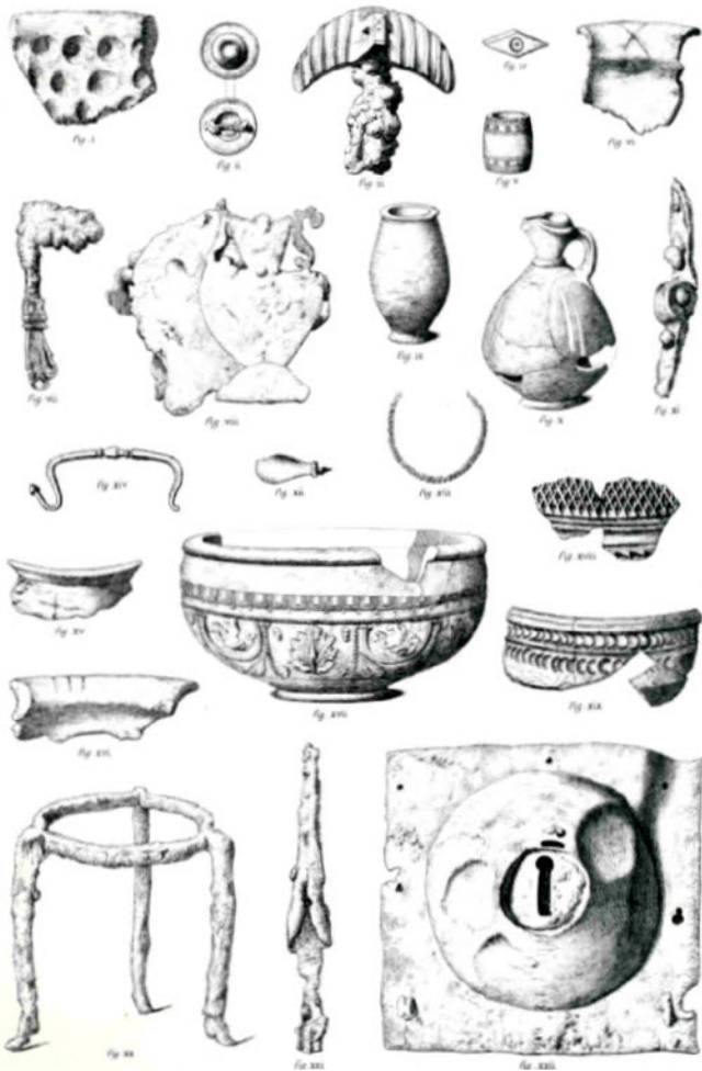
Objects discovered during the Victorian excavations